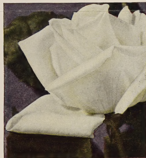
FRAU KARL DRUSCHKI